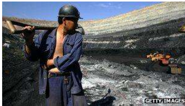
Demand for energy in China will more than triple by 2030, analysts forecast

While China is currently running half a dozen carbon capture and storage (CCS) projects - which aim to capture CO2 emissions from coal plants and bury it underground - the technology is nowhere near commercial viability.