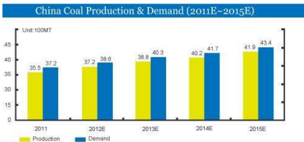
China Coal Production and Demand (2011-2015)