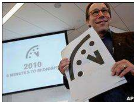
The Doomsday Clock has shifted to six minutes before midnight

The Doomsday Clock - a barometer of nuclear danger for the past 63 years - has been moved one minute further away from the "midnight hour".