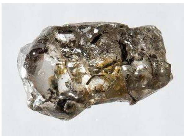
A diamond from Juína, Brazil, containing a water-rich inclusion of the olivine mineral ringwoodite

A battered diamond that survived a trip from "hell" confirms a long-held theory: Earth's mantle holds an ocean's worth of water.