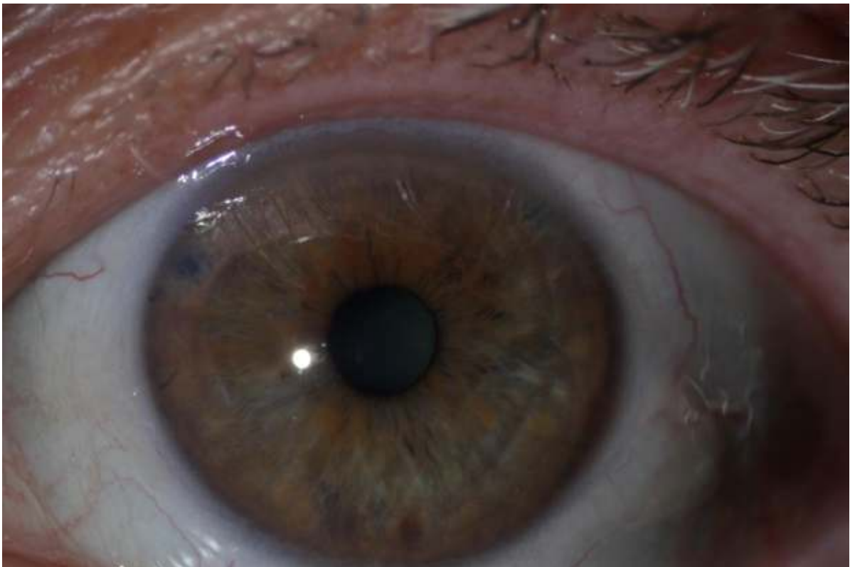
Original Colour Iris Photograph