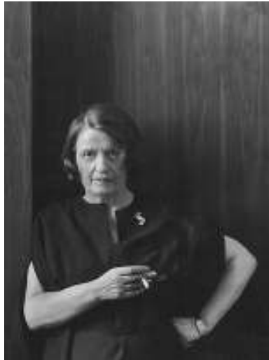
(Ayn Rand in later life - Date unknown)

She considered Objectivism a systematic philosophy and laid out positions on metaphysics, epistemology, ethics, political philosophy, and esthetics. (Source - adapted from Wikipedia)