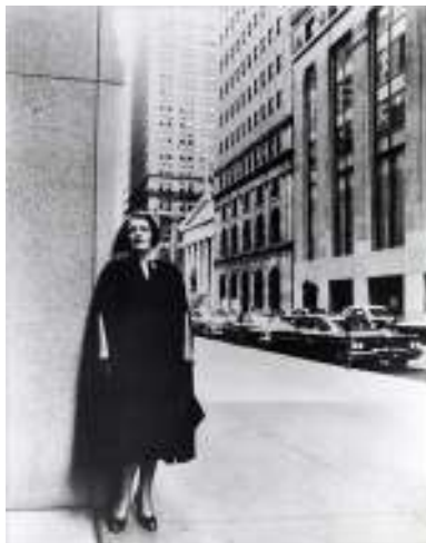
(Ayn Rand in 1964)