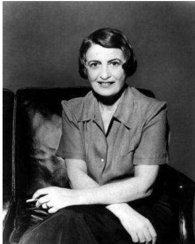
(Ayn Rand in 1957) (b. 1905 - d. 1982)