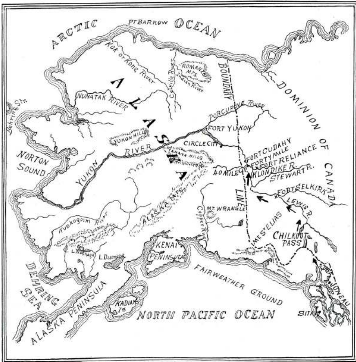
Map of The Yukon Gold Diggings - 1897

Sitka appears at the southeast corner of this map, and northeast of it is Juneau, the usual fitting out place for miners going to the Yukon.