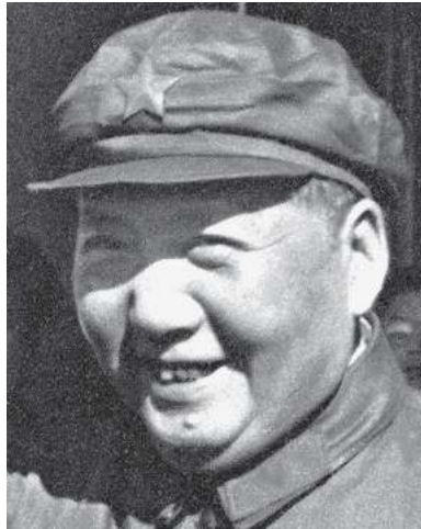
(Mao Tse-tung - 1893-1976)

Mao attended primary school, where he studied traditional Confucian classics. Later, he became a Marxist while he was working as a library assistant at Peking University