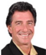
T. Harv Eker