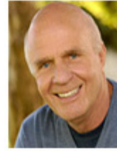
Dr. Wayne W. Dyer

Millions Of People Have Already Benefitted!