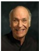
Jay Conrad Levinson