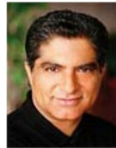
Dr. Deepak Chopra